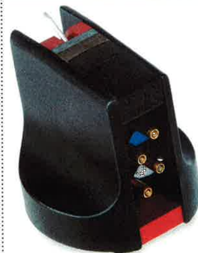
ABOVE: Recessed signal pins are a little fiddly to wire up but make the connections look neat once installed